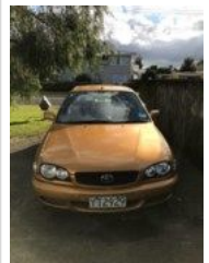
Photo of similar vehicle

Valid as at 21 August 2018 00:16 AM . Reference: 1166b577