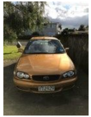
Photo of similar vehicle

Valid as at 21 August 2018 00:16 AM . Reference: 1166b577